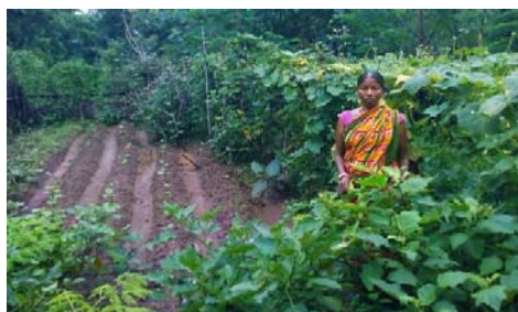
Home Nutrition Garden

NIRDPR, Hyderabad conducted an intensive Interim Review on MKSP activities in our area of implementation. Activities, both physical and financial, were scrutinized thoroughly during a weeklong study. The National Resource Person (NRP) visited the field areas of Birbhum and Purulia and interacted with MKs and also visited HQ to verify the financial transparency. He was satisfied with our best practices in field as well as in HQ level. NIRDPR submitted a detailed report and appreciated LKP's work in all respects. A Third party Assessment was also conducted by Jalpaiguri Vivekananda Education Society, Regional Council, PKVY project, Govt. of India. The report was highly satisfactory and submitted to MoRD as well as the WBSRLM.