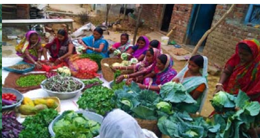
Products of Mahila Kisans